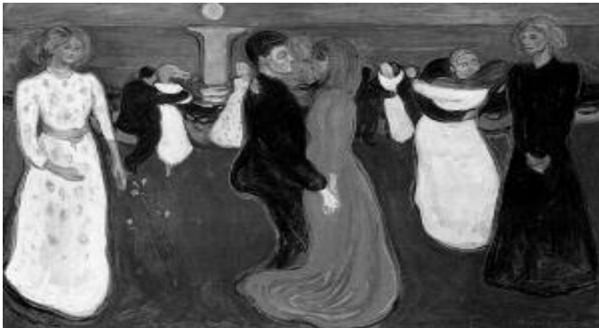
The Dance of Life by Ibsen's Norwegian contemporary Edvard Munch sums up the three stages of a woman's life: youth, marriage and widowhood.