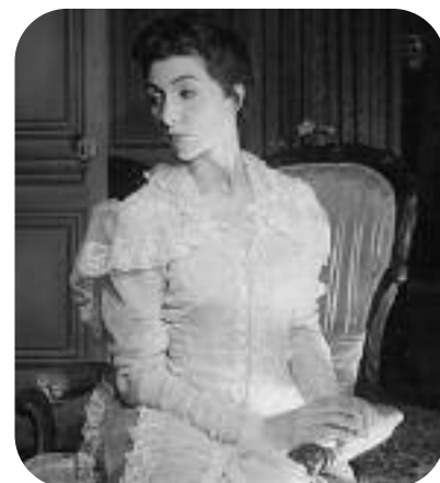
This photograph from the 1958 Birmingham Rep production is of June Brown in the role of Hedda. Brown is these days better known for her role as Dot Cotton in EastEnders.

When we watch Hedda Gabler now, is it possible to see that in its time many women saw it as a call to revolution?