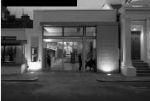
The Almeida Theatre

Originally built as a lecture theatre, the Almeida is a Grade II listed building. The nature of working in a found space puts some restrictions on us as audience and artists. For example, our seats are designed to take up as little space as possible and aren't always as comfortable as other theatre seats. We have a few pillars holding up the circle which you may have to look round from where you are sitting. The best thing about the Almeida is how we are able to produce the epic on an intimate scale with a very close connection between the performers and the audience. That's why we're very strict about asking everyone in our audience to turn off mobile phones, not to eat, cough or whisper during the performance. Please try to remember that everything that happens in the audience is heard and seen by the cast on stage. We want every performance to be a great one and we ask for your help to ensure that it is.