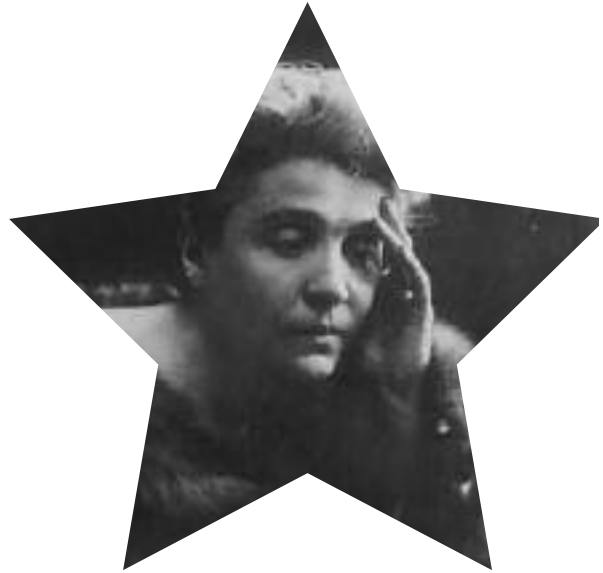
Eleanora Duse as Hedda 1904-08

In contrast to the great French actresses she avoided all "make-up"; her art depended on intense naturalness rather than on stage effect, sympathetic force or poignant intellectuality rather than the theatrical emotionalism of the French tradition.